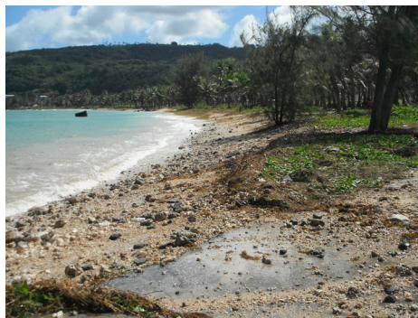
War in the Pacific Park Beach, Asan, Guam. A beach impacted by the swell event in January 2013.

NWS watched the swell arriving via the PacIOOS wave buoys in Tanapag, followed by Ritidian Point. Then, the forecasters witnessed the swell as high surf at Paseo Park, a popular surfing and recreational area with northern exposure in Hagåtña. With advanced warning for Guam and Rota beachgoers, no one was injured, despite the large north swell event. Thanks to the team at the NWS Forecast Office on Guam and their effective use of the new PacIOOS wave buoys, this story has a happy ending.