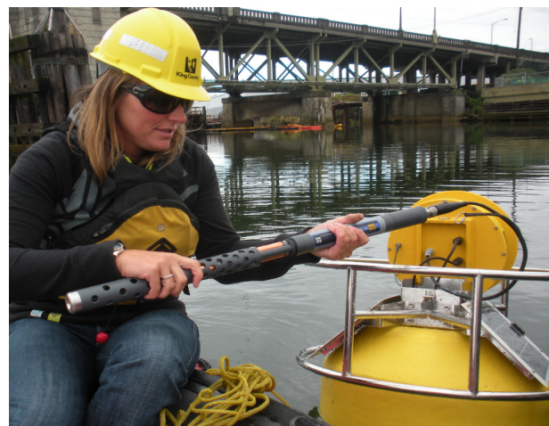
EMM68 Buoy supports a single water quality instrument, such as a YSI EXO or 6600 V2-4 Sonde, positioned inside the subsurface pipe

Contact YSI's Integrated Systems & Services division to discuss your specific monitoring application. We offer a variety of buoy platforms which can be tailored to fit your needs. Our other systems are suited for deployment in high-energy environments and for long-term monitoring projects